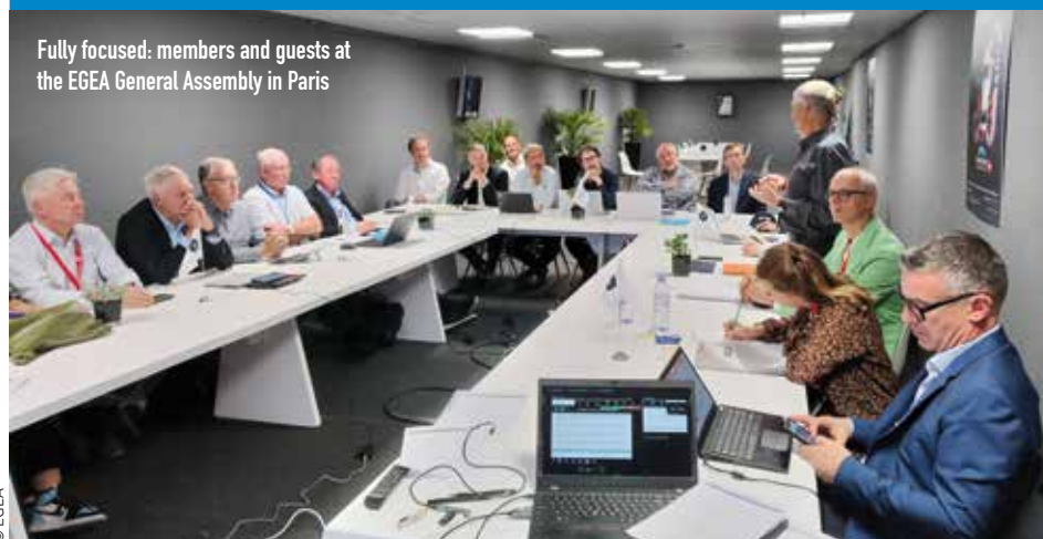
Fully focused: members and guests at the EGEA General Assembly in Paris

The EGEA General Assembly took place on October 17 in Paris, kindly hosted by GIEG France during the Equip Auto Exhibition. Members enjoyed a welcome lunch offered by GIEG. A highlight of the meeting was the participation of EGEA's valued sponsors—Equip Auto, Autopromotec, and Automechanika—who shared updates and future plans for their exhibitions. Members approved the 2026 Budget, discussed the latest on Regulation 858 (access to in-vehicle data) and the RWP update, and exchanged views on key aftermarket challenges. The next General Assembly will be held on May 27–28, 2026, in Oslo, Norway.