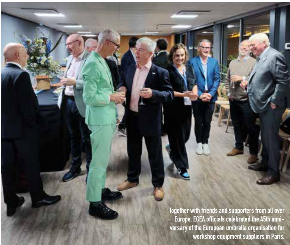
Together with friends and supporters from all over Europe, EGEA officials celebrated the 45th anniversary of the European umbrella organisation for workshop equipment suppliers in Paris.

We extend our heartfelt thanks to all members and partners whose commitment and expertise have made EGEA what it is today: a respected, forward-looking association. Together, we will continue to build a sustainable future for European mobility. Here's to the next 45 years of progress, partnership, and innovation!